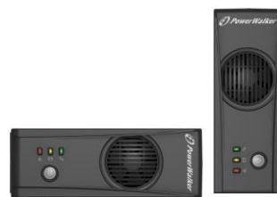
2-in1 Rack/Tower design