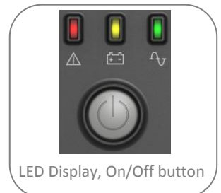
LED Display, On/Off button